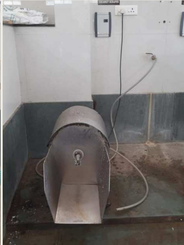
VEGETABLE CUTTING MACHINE