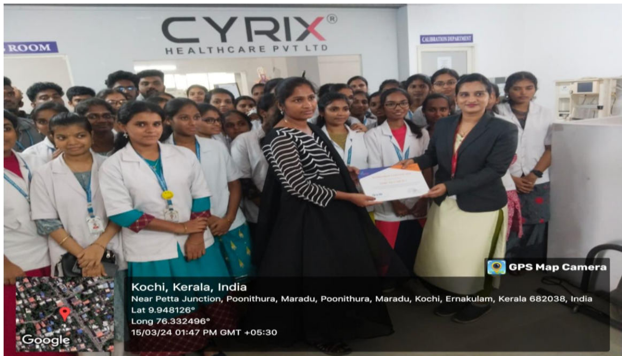
Cyrix healthcare Pvt Ltd,Poonithura, Kerala

Cyrix Healthcare Pvt Ltd has made a name for itself in the list of top suppliers for Ultrasound machines and radiological equipment in Kerala. This company is located at Poonithura, Kerala. In addition to manufacturing Ultrasound machines, Cyrix Healthcare Pvt Ltd also provide services and internships for biomedical students.